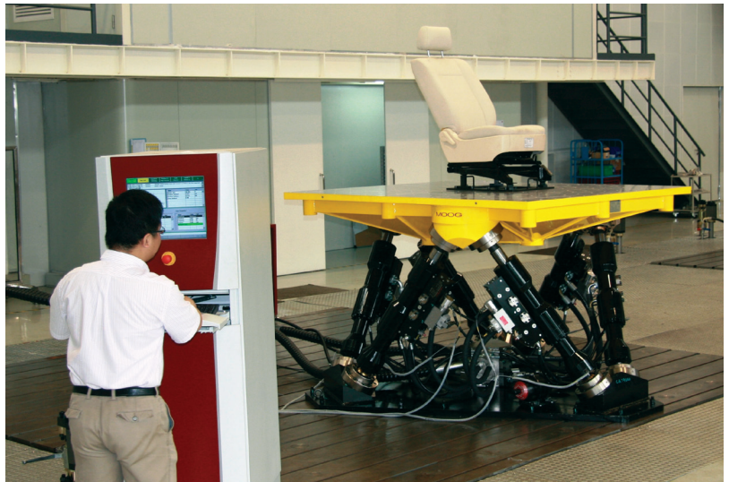
A German-based engineering services firm technician tests vehicle components using the new Moog simulation table.

Because the system uses vector motion rather than moving individual axes in a single plane, Ehmann says results are more realistic and similar to motions a component under testing would experience in the real world. In many orthogonal systems, multi-axis tests are implemented one plane at a time. The Moog system allows all of the testing to occur at once and, in some applications, the user is able to significantly reduce the amount of testing time.