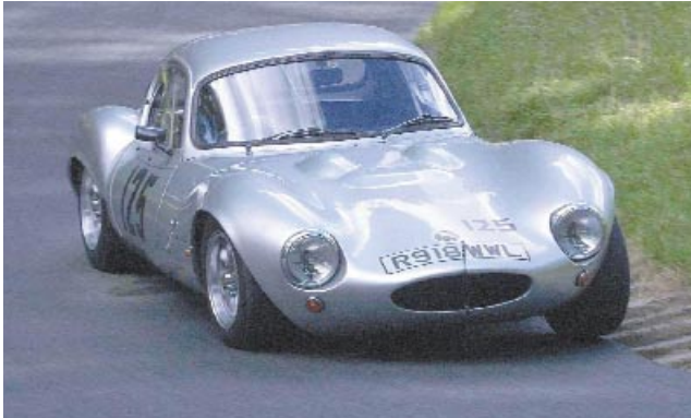
LEADER OF THE PACK: Servovalves are increasingly being applied in clutches, gear shifts, differentials, and throttles on racing vehicles.