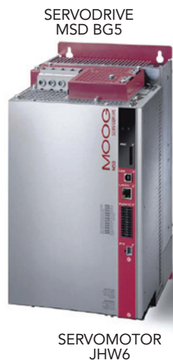
SERVODRIVE MSD BG5

Geiger says the key to higher adoption is the overall value of the variable speed pump. When there is a requirement for high performance and, in particular, high repeatability machines, OEMs move to an electric solution. And for high-speed machines, users typically move to servo valve hydraulics. Those are the areas where the variable speed pump technology is not a fit, but it does fit in 90 percent of applications.