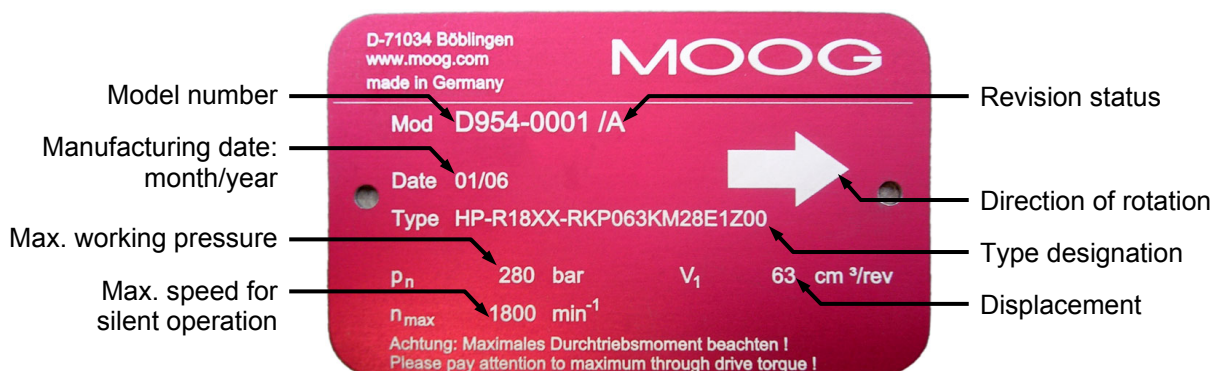
Figure 3: Nameplate of the RKP-II

The layout of the nameplate of the RKP-II can be seen in Figure 3. For systems made up of multiple pump stages, each individual stage will have its own nameplate