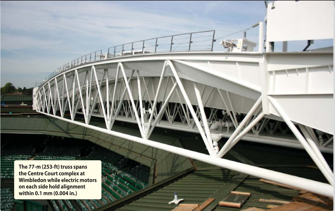
The 77-m (253-ft) truss spans the Centre Court complex at Wimbledon while electric motors on each side hold alignment within 0.1 mm (0.004 in.)

rolls along two sets of parallel rails to move the roof section. Overall, 40 bogie motors, two on each of the wheeled carriages, position the roof trusses.