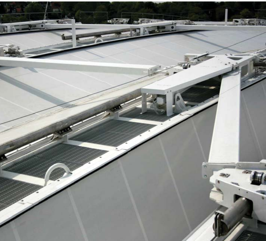
Swing arms stabilize the top of each truss as it moves into position. The angle of the arm tracks the relative distance of the truss from its neighbor.

When the Wimbledon Championships kick off later this month on the grass courts at the All England Lawn Tennis and Croquet Club , players won't have to worry about being rained out. In 2004, All England entertained proposals for a retractable roof operated by hydraulic cylinders.