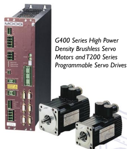
G400 Series High Power Density Brushless Servo Motors and T200 Series Programmable Servo Drives