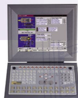
IM400 Machine Controller