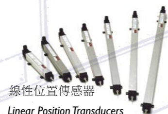
線性位置傳感器 Linear Position Transducers