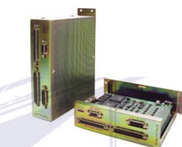
Digital Velocity and Pressure process Control Card