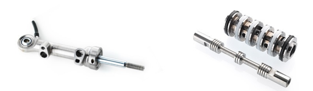
Figure 3: Pictured left: Moog E085 actuator used on throttle and turbocharger. Pictured right: Two ancillary Moog products – A hydraulic cylinder and power steering valve weighing 65 g and 35 respectively.