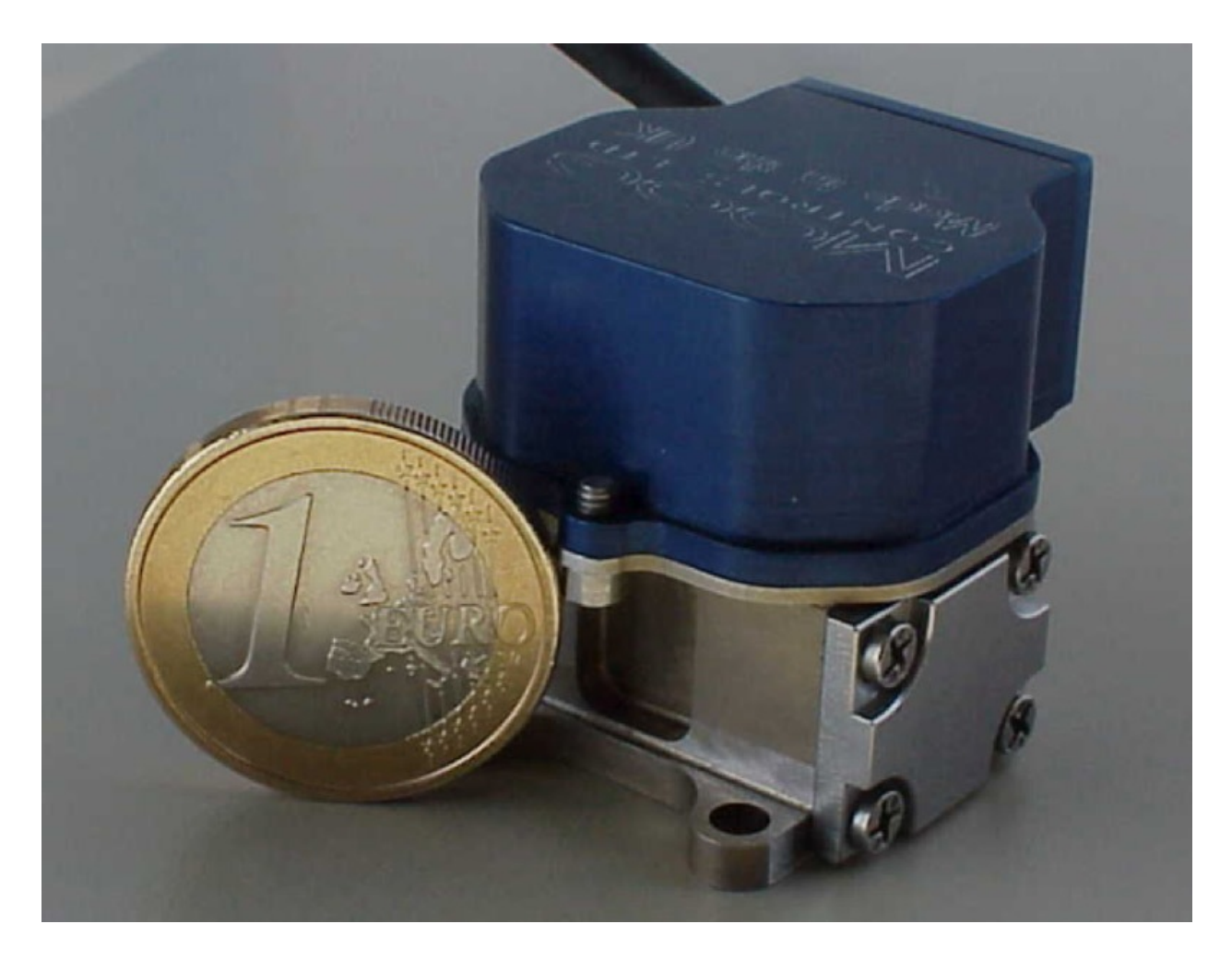
Figure 2: Moog 24 Series Servo Valve illustrates degree of miniaturization required by F1

A good illustration of this 'power dense' technology the Moog E024 Series Miniature Servo Valve, which is crucial in converting signals from the car's Electronic Control Unit (ECU) into the hydraulic flow providing the motive force of the actuators. This tiny device weighs just 92 g (3 oz) and can control up to 2.8 kW of hydraulic power from a 10 mA electrical signal.