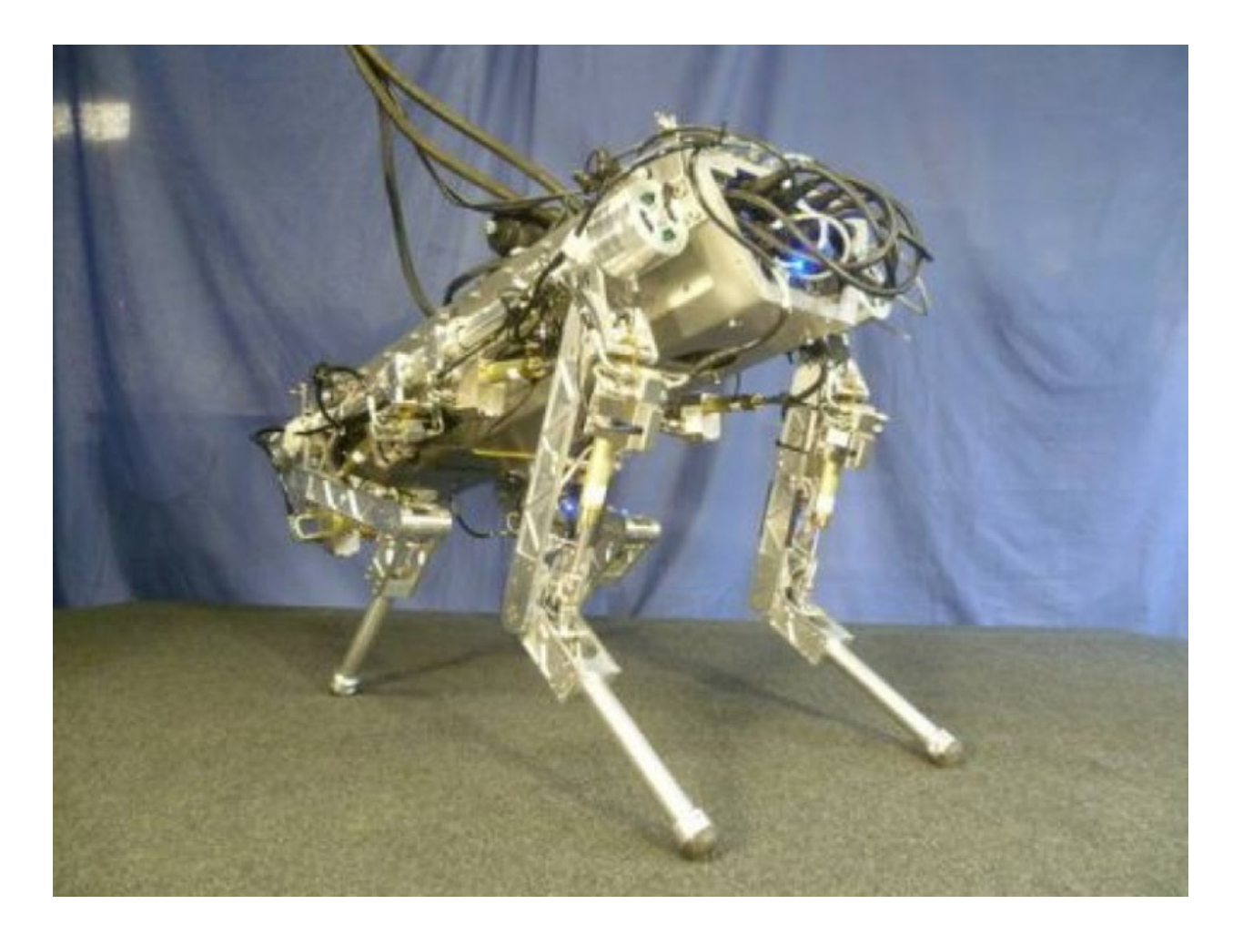
Figure 4: Autonomous hydraulic robots have similar design requirements to F1.