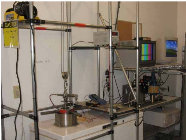
Pressure Testing Station

Focal's facilities include two complete pressure testing stations, each certified for 10,000 psi maximum test pressure. The pressure housings are installed in a controlled cooler to allow simultaneous testing at maximum pressure and low temperature to better simulate real ocean conditions at depth. All test results are recorded by serial number for reference to production jobs and later used in statistical analysis and process control. Careful monitoring of materials and assembly procedures is crucial to maintaining high yields in the screening process.