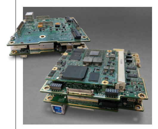
BACK: Side side view of DD-iX5 without enclosure showing top side iX5-EXT-100 extension interface board with M.2 SATA.

FRONT: Side view of DD-iX5 without enclosure showing standard configuration. iX5-CORE-1000 from bottom side with e2000/e2100 compute solution, and default iX5-EXT-100 extension below).