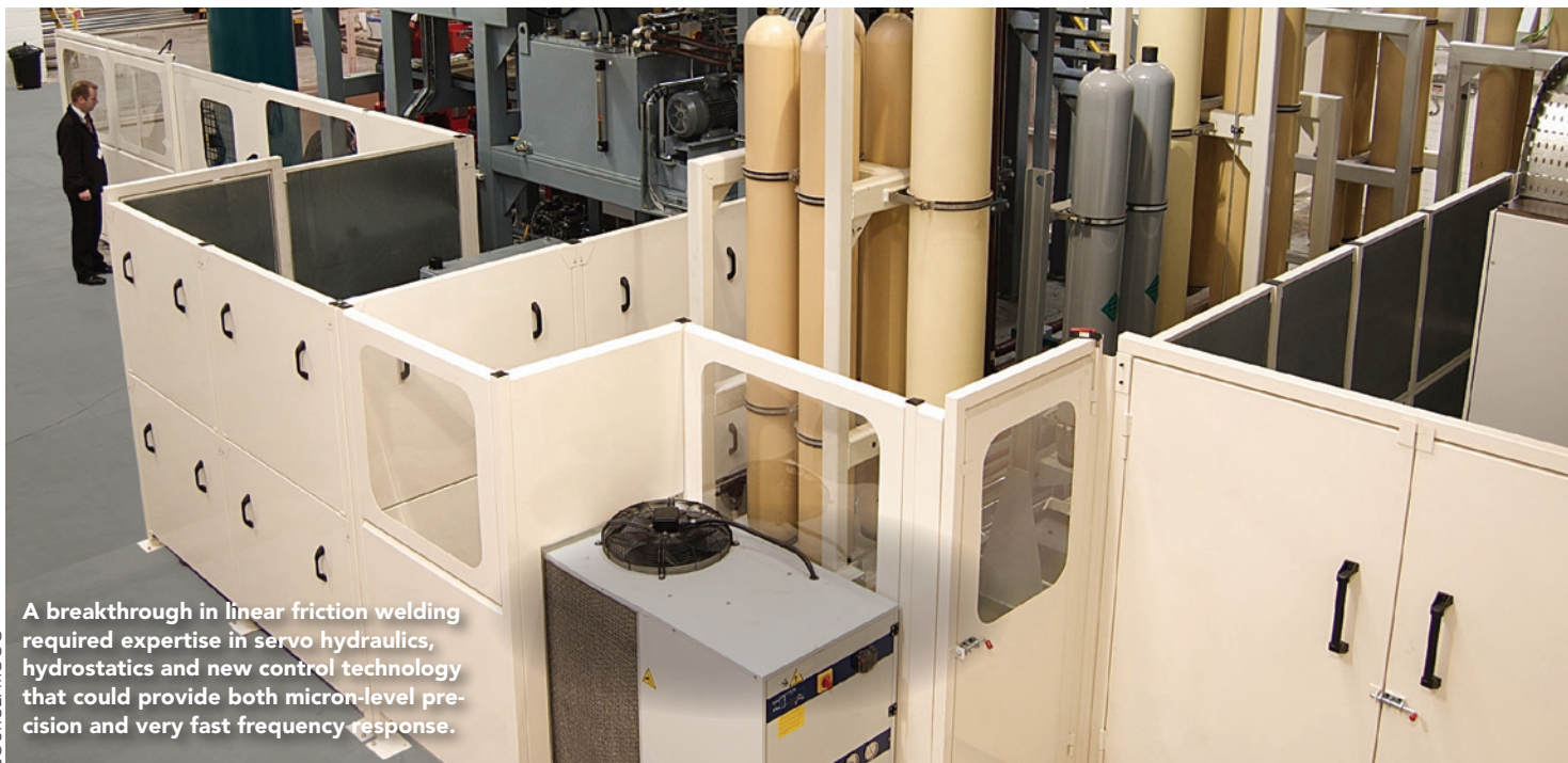
A breakthrough in linear friction welding required expertise in servo hydraulics, hydrostatics and new control technology that could provide both micron-level precision and very fast frequency response.

The E100 also allows for welded fabrication of parts that previously needed to be machined from solid metal, a process that can result in up to 80 percent material waste. It could "transform how jet engines are manufactured by cutting