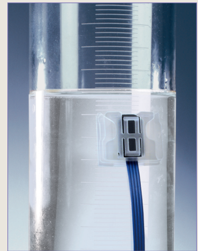
The LifeGuard Point Level Sensor shown mounted using disposable, self-adhering mounting bracket.