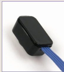
LifeGuard Point Level Sensor shown actual size.

The LifeGuard Point Level Sensor from Moog successfully integrates proven and reliable technology in an extremely small and versatile package. The LifeGuard Point Level Sensor provides continuous liquid level monitoring and can be mounted using our unique disposable, self-adhering mounting bracket, or by integrating the sensor into the customer's product. Moog's patented design enhances ease of use by enabling the sensor to be acoustically coupled to the outside of a rigid vessel wall without the use of coupling gels.