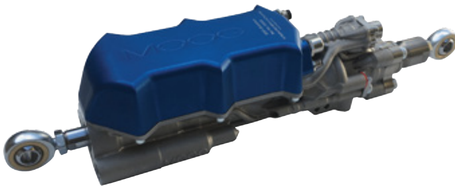
Integrated Smart Actuator for micro-hydraulic robotic applications