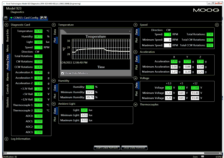
Slip Ring Sensor Software

All specifications and information are subject to change without notice. Please contact Focal for the latest updates.