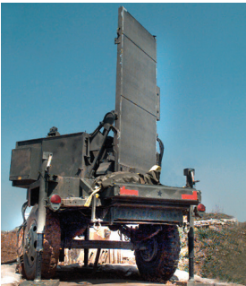
U.S. Department of Defense

The test plan outlines the specific tests that were conducted in accordance with per MIL-STD-810F and how these products performed under those conditions. For vibration, Moog performed several tests to ensure an understanding of the hardware's capabilities. To establish baseline criteria, Moog used functional requirements of a new product and provides the results in this data sheet. Based on these tests, Moog confirms that its industrial products will indeed meet or exceed many of the MIL-STD-810F requirements.