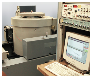
Vibration Test Fixture

MIL-STD-810F testing has demonstrated that Moog's industrial COTS products are suitable for many military applications. Contact an Applications Engineer to discuss ways to add low cost, effective solutions into your next application.