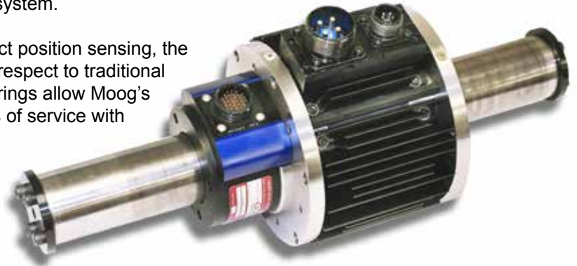
Linear motors are a high force, direct drive solution for industrial applications.

Other common names for this device include linear servo, brushless motor or linear servo motor.