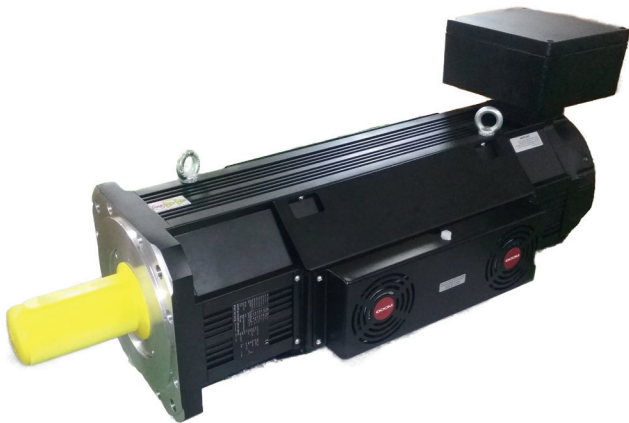
Moog MD Series JSF7-245 Servo Motor (30kW)

Initially, Chin Fong provided Moog with the ILS1-160's mechanical & electrical specifications, which included: