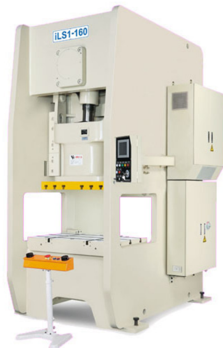
iLS1-160 Servo Press

The Moog / Chin Fong team began focusing their efforts on developing a smaller sized servo press machine of up to 500-tons, given that market opportunities for large servo press machines were limited. Subsequently, the company hoped that successful development of its 160-ton iLS1-160 servo press would eventually allow them to penetrate additional, larger size machinery markets.