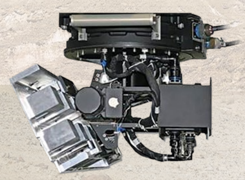
TWO-AXIS AIRBORNE GIMBAL WITH INTEGRAL SERVO ELECTRONICS