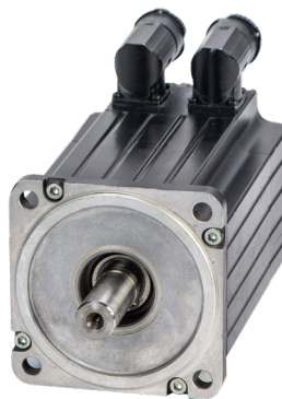
CD Series Servo Motor