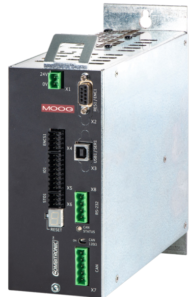
DS2020 Combitronic™ Servo Drive