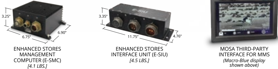
SMS Solution for Advanced Weapons Systems (Dimensions are in inches)