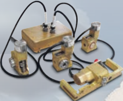
LONG RANGE FIN AND WING ACTUATION SYSTEM