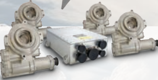
ROTARY CONTROL ACTUATION SYSTEM