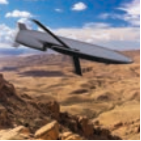
Fin Control and Wing Deploy Actuation Systems