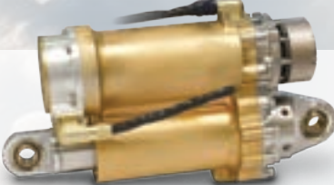
LINEAR CONTROL ACTUATION SYSTEM