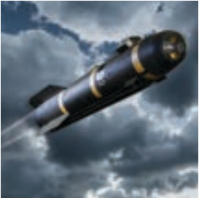
Fin Control Actuation Systems