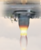
ROCKET ENGINES AND SYSTEMS