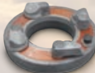
JET TAB ACTUATOR ASSEMBLY