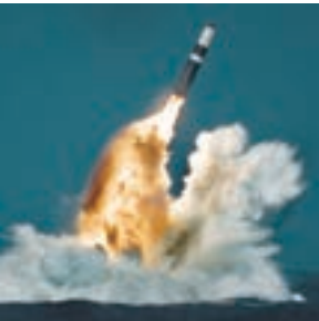
Thrust Vector Controls