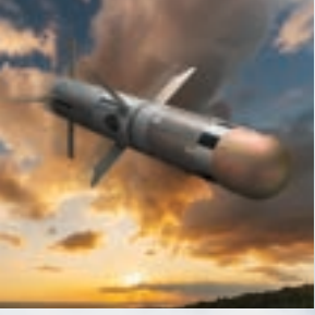
Fin Controls and Shutter Actuation