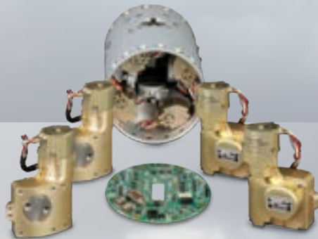
FIN CONTROL ACTUATION SYSTEM