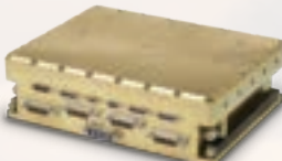
AVIONICS AND CONTROL ELECTRONICS