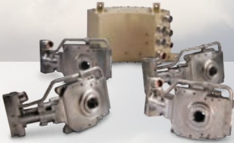
SUPersonic CONTROL ACTUATION SYSTEM