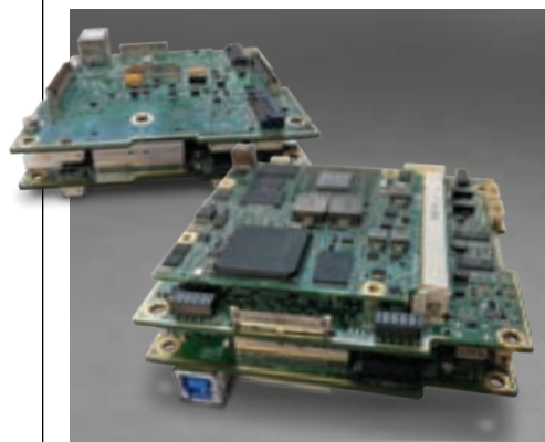
BACK: Side side view of DD-iX5 without enclosure showing top side iX5-EXT-100 extension interface board with M.2 SATA.