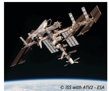
© ISS with ATV2 - ESA