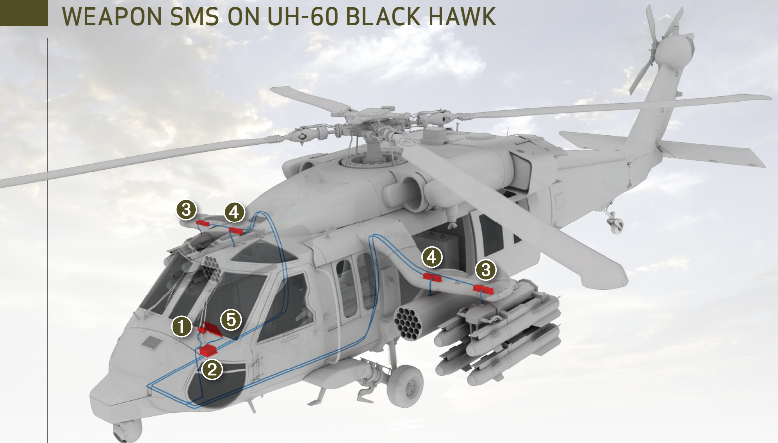
UH-60 Black Hawk Digital SMS Components (Dimensions are in inches)