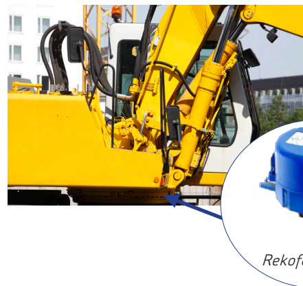
Figure 1: Slip ring for power and signals

insulating contaminants coming between these two sliding conductive surfaces.