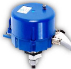
Figure 4: Slip ring protective housing

The electromagnetic environment should also be considered. “Contamination” from conducted or radiated electromagnetic noise can result in spurious data coupling onto digital data channels. Proper electromagnetic shielding is an important slip ring feature.