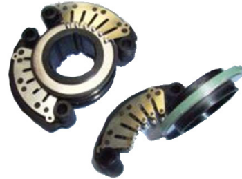
Figure 2: Ring brush assembly showing six contact elements

brushes simultaneously resulting in very low BER ( 10^{-12} or better). Proper brush design must also take into account the shock and vibration environment found on construction equipment. Again, redundancy is important as is the contact force and the relative mass of the brush in order to keep the resonant frequency of the brush well above operating excitation frequencies.